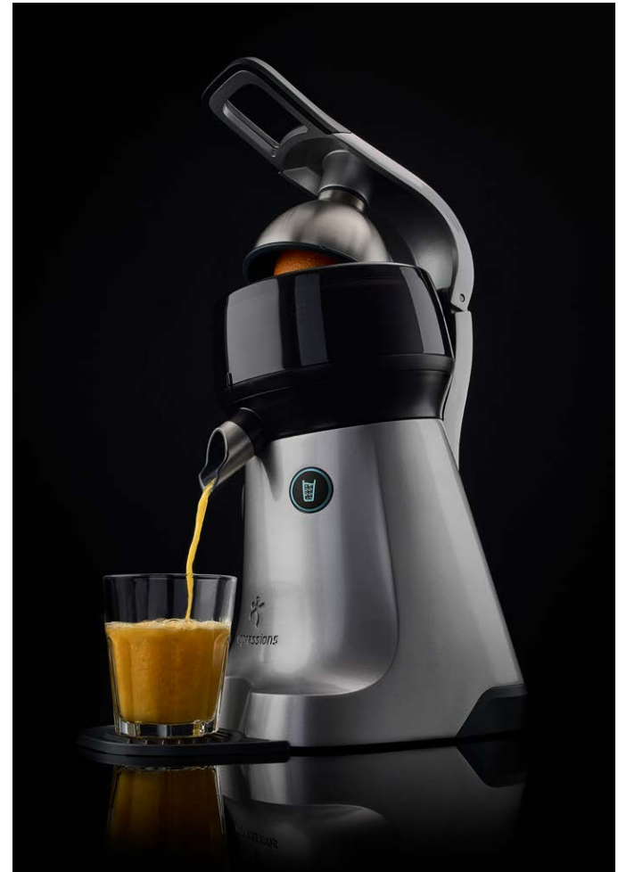
ABOVE the Juicer by Espressions.

Conceived and developed in the Netherlands, the Juicer is designed and built to last a lifetime. Espressions even warrants the induction motor for a lifetime. The solid body,